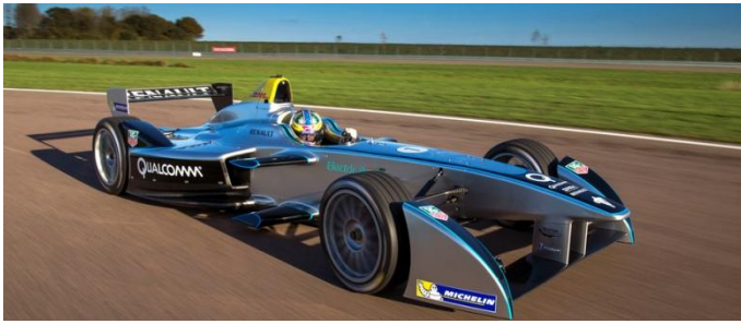
Figure 4: Spark-Renault SRT_01E; Debut in Formula E championship

Electric Vehicles: Why or Why Not? Electric Vehicles still do not have a mass appeal as strong as conventional gasoline vehicles. The market for EV's also does not attract a large number of customers. One of the major causes for this is the number of myths which exist for use of EVs and people need to be made aware that they are baseless. Some of the myths can be enlisted as follows: