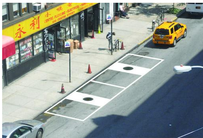
Figure 2: A view of the HEVO Power pilot project, New York City.

A New York based startup HEVO Power is developing the concept of Green Parking and Green Loading Zones. In this concept, manholes would be equipped with wireless chargers and electric vehicles would similarly be equipped with a wireless receiver to receive the charge. As a result, commuters would get premium parking, there would be less congestion of roads, and EV owners would benefit from extension of current driving ranges. This pilot project has been tested in New York City.